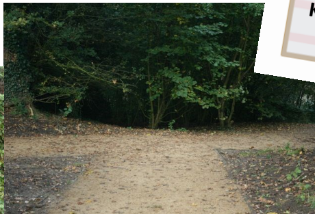
Poor's Wood Path